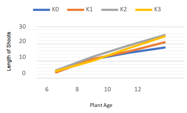
Figure 2 – Shoot Length Growth of Siam Banjar Orange Grafting Seedlings (cm) aged 6, 8, 10 and 12 weeks after grafting due to application of goat manure

According to the results of the analysis of 100 g/polybag goat manure (K1) used in this study, macro nutrients, especially nitrogen nutrients at 3.03%, phosphorus at 1.33%, and potassium at 1.69%, are very influential on plant vegetative growth, one of which is shoot length, so that plants have produced the best results on shoot length variables (Figure 2).