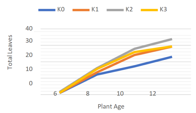
Figure 3 – Increase in number of leaves (strands) on plants aged 6, 8, 10 and 12 weeks after grafting due to application of goat manure

Goat manure 100 g/polybag (K1) generally gives the best results on the variable number of leaves (Figure 3). The results of the analysis of the goat manure used in this study showed that it contained macronutrients, particularly 3.03% nitrogen, 1.33% phosphorus and potassium 1,69%.