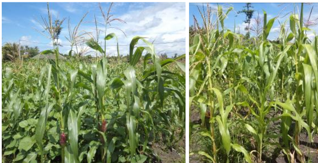
Figure 1 – Performance of the waxy maize plants growing on the treatment of maize additive intercropped with 2 rows of mungbean (Left) compared with the maize plants growing on the monocrop (Right), in which leaves of the waxy maize plants were greener in the intercropping than in the monocrop treatment

Although there was a significant effect of intercropping the waxy maize plants with the legume crops (Table 1), average N uptake in the leaves of the waxy maize was higher only on the ML1 and ML2 treatments, while between ML0 and ML3, there was no differences, and the average was lowest in the ML3 treatment, and significantly lower than the average in the ML1 and ML2 treatments (Table 2).