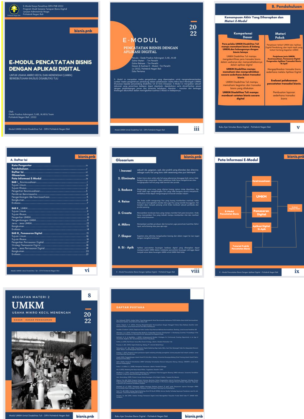
Figure 2 – E-Module pages

prefer direct involvement in the field rather than paying attention to complete records. When they go down to the field, the Deaf Disabled Persons actually really want to know new things that can be complementary materials for them in carrying out their selling activities, but in adjusting business transactions with records made by normal people in general, they need to be further deepened to understand, This can be seen during the purchase transaction process at one of the SMEs Deaf Disabled Persons, where when they asked (in sign language) regarding the recording of sales, they admitted that they did not focus too much on it but in the future would like to know how to record correctly.